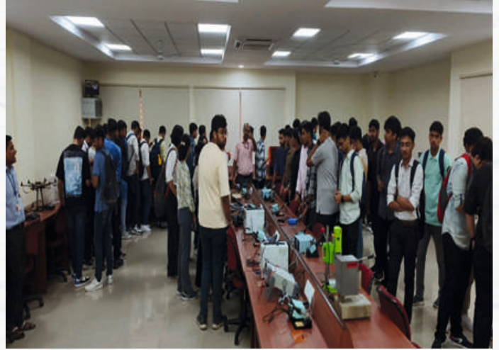
Visit to Motherson Technology Services Ltd.